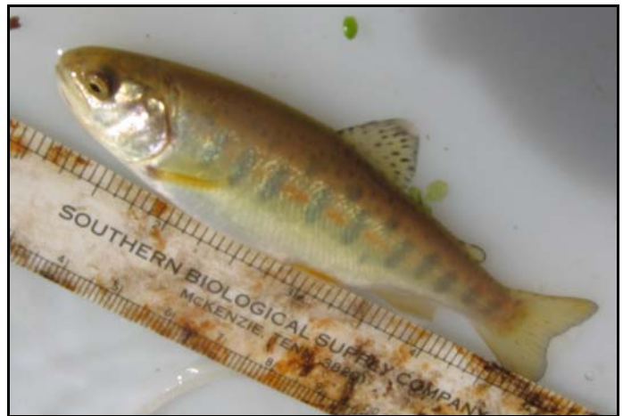
Wild (juvenile) Brook Trout

Finally, to tempt you a little more let me to show you what else we found in Lititz Run while during our annual fish monitoring day.