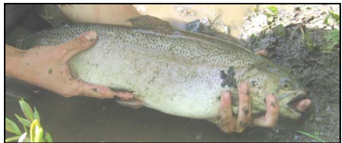
"Boss Hog" Rainbow Trout