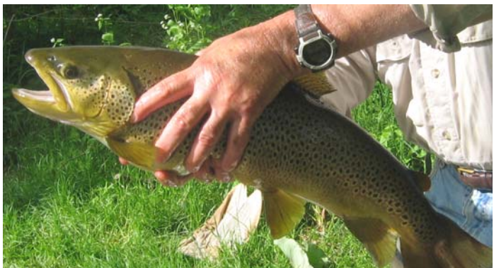
"Monster" Brown Trout