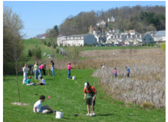
Little Conestoga Watershed Alliance Earth Day tree planting event at Jacobs Creek.

For a list of future watershed events & meetings check out www.lancasterwatersheds.org