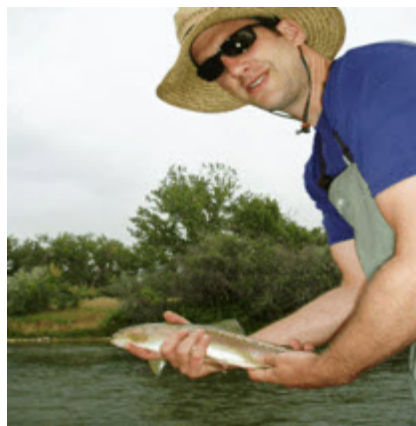
With six to ten thousand trout per mile we caught plenty of nice browns

drive away in northern Wyoming. The scenery is refreshing, awe-inspiring and really helped us appreciate the time we were able to spend there. It certainly does not make it easy to come back home! This was truly a trip that we will cherish for a long time, and we hope to be back out to Camp 6x soon. If you are thinking about bidding on the trip next year, please don't, we want it all for ourselves again!!!